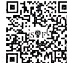
Scan the QR code to get important updates

Note: All disputes are subject to Delhi jurisdiction only. Visit www.sofworld.org or www.facebook.com/sofworld for more info. *THIS FORM MAY BE RETAINED BY SCHOOL. *The phone number provided above will be used to communicate information related to SOF exams including registrations, preparatory material, schedule of exams, results, awards and other useful details.